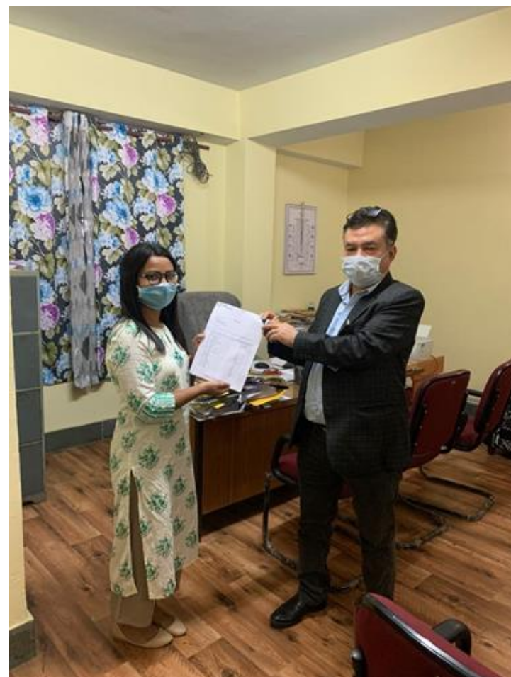
Groceries and Vegetables handed over to Covid control room mess

Food ration and vegetables provided to Covid control room mess of the Health Dept Secretariat (Government of Sikkim)