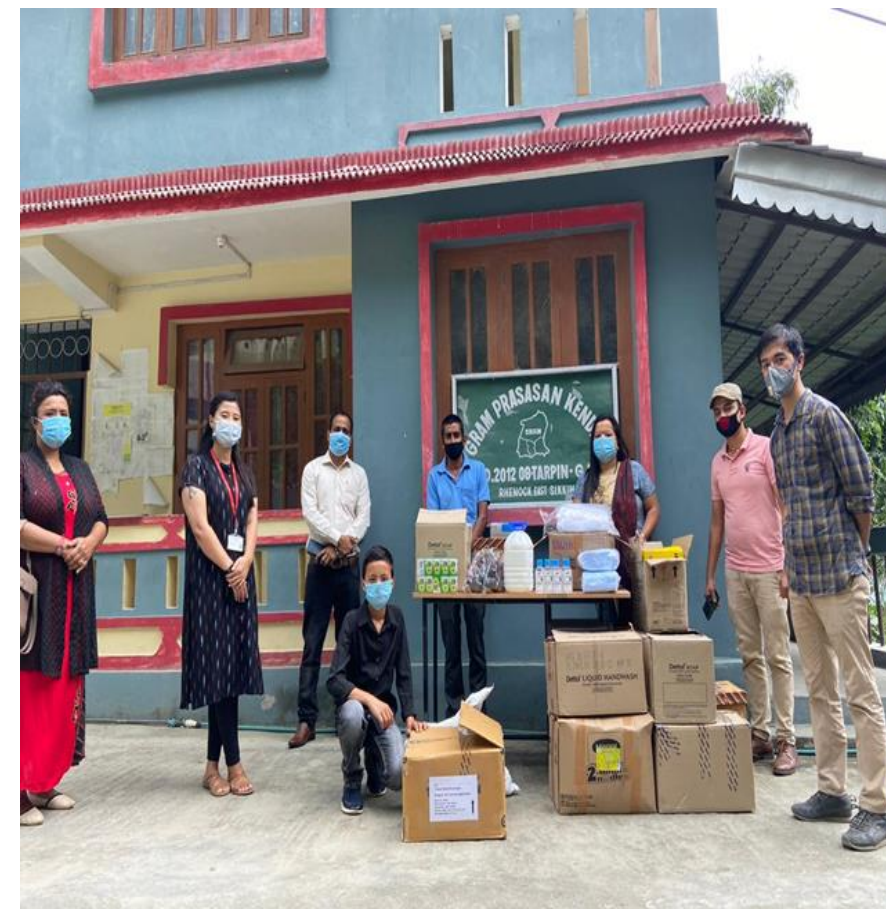
Hygiene supplies to the Panchayat