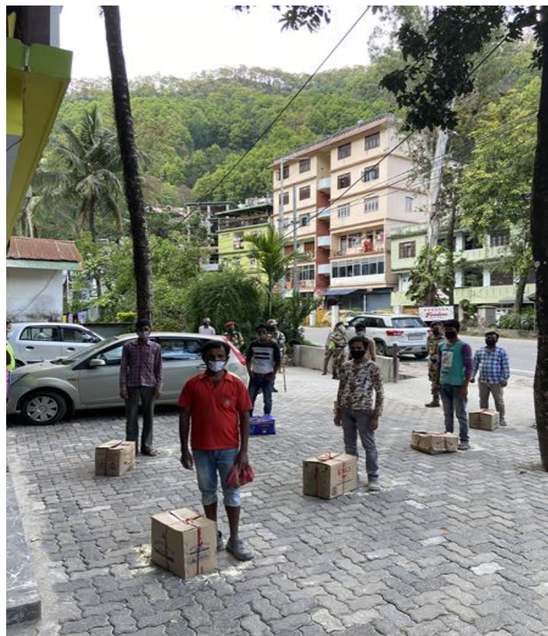
Groceries for daily wage labour