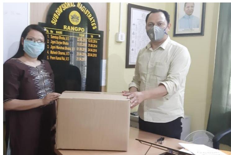
Disposable Aprons Set (PPE) for frontline health workers