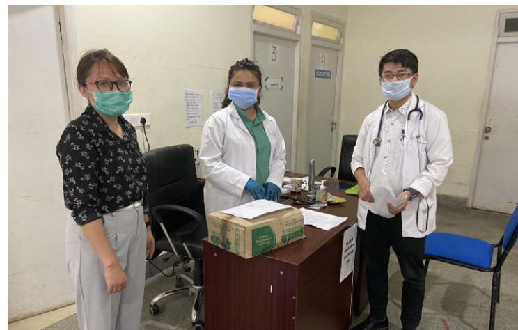
Support to Hospitals