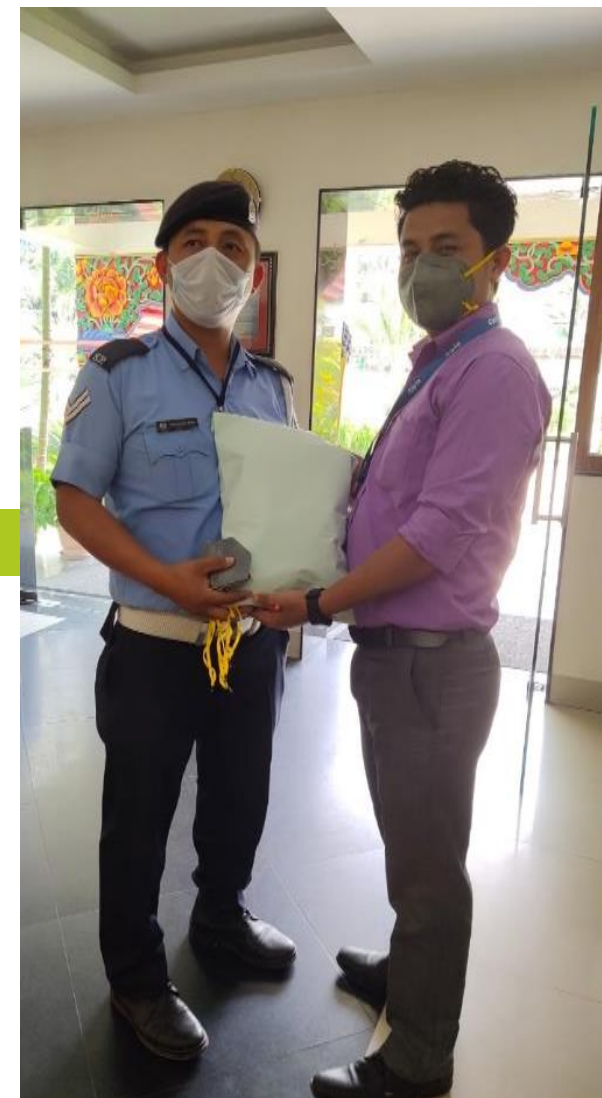
Support to local traffic police