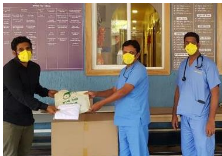
Safety gear for frontline doctors & paramedics