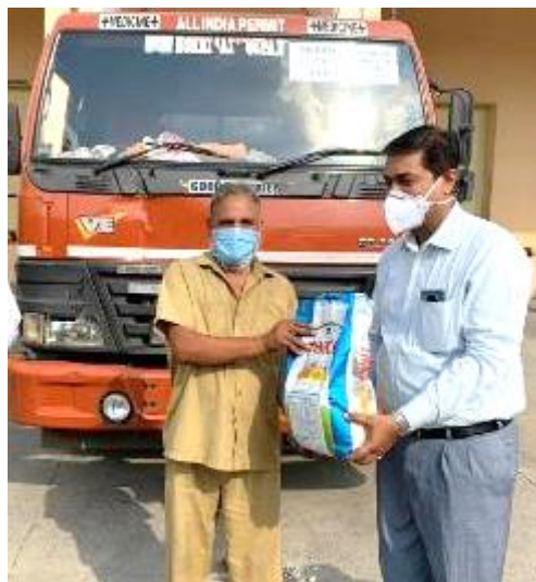
Food supplies for Truckers

Safeguarding Doctors, Frontline Health Workers, Local District Administration with Masks, PPE Kits, Sanitizers