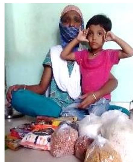
Ration for families