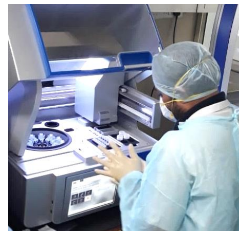
24/7 Covid testing laboratory