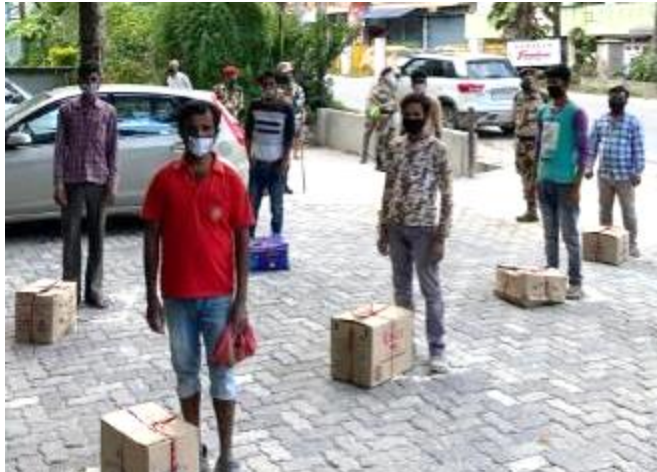
Daily essentials for those in need