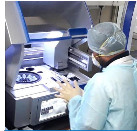
24/7 Covid testing laboratory