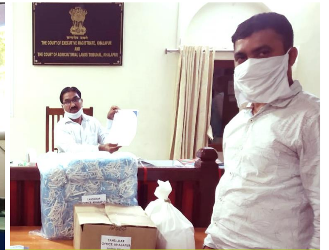
Support to local administration