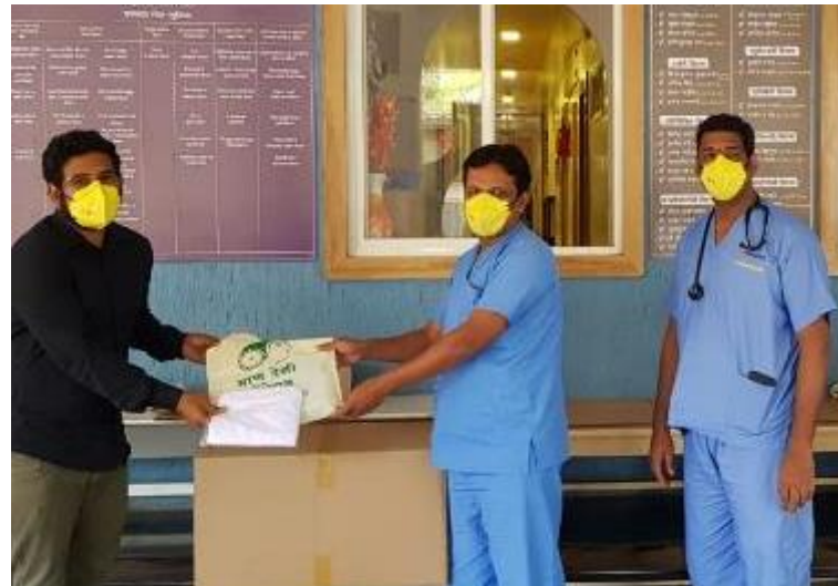
Safety gear for frontline doctors & paramedics