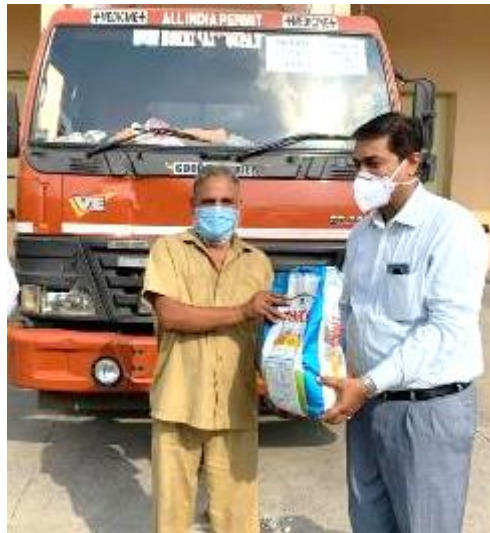
Food supplies for Truckers

Safeguarding Doctors, Frontline Health Workers, Local District Administration with Masks, PPE Kits, Sanitizers