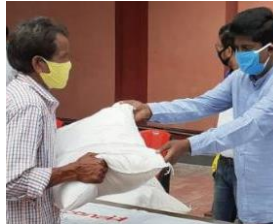
Rice for migrant workers