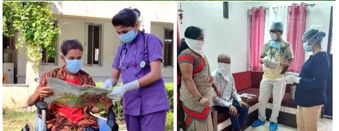
Caring for patients at the Centre and at their homes