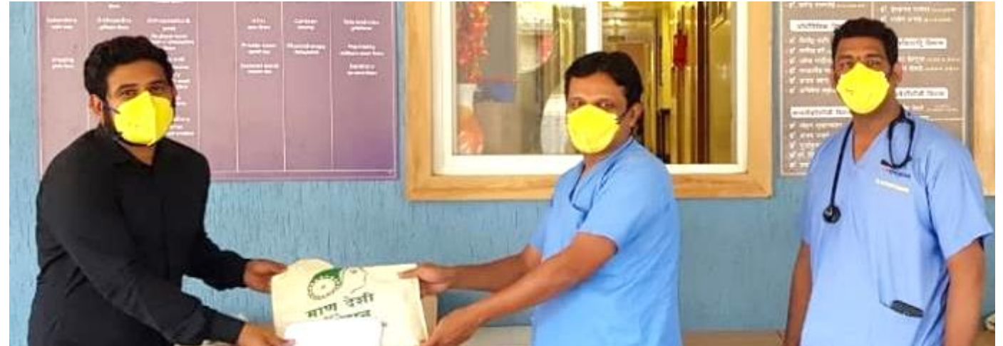
Safety Gear for frontline health workers