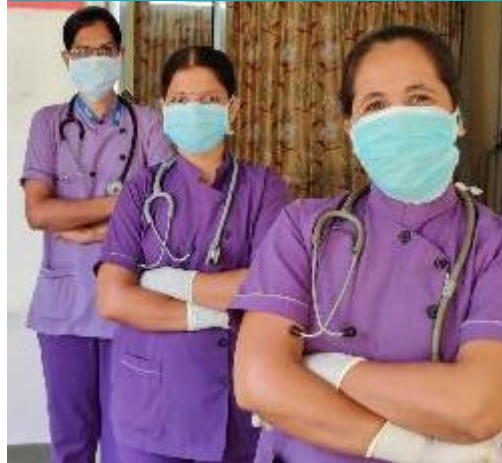
Safeguarding health care workers