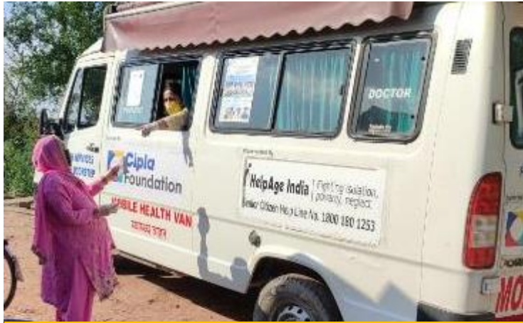
Mobile Healthcare Units reach remote locations