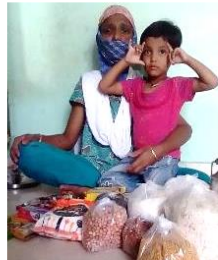
Ration for families