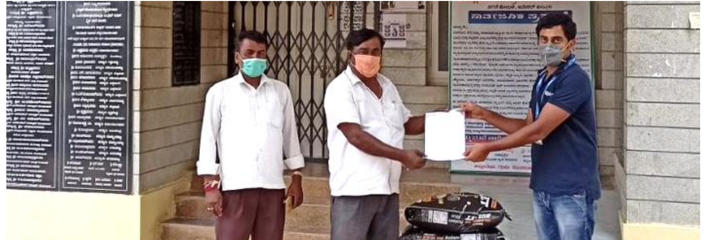
75 Rice Bags for people in remote communities through panchayat