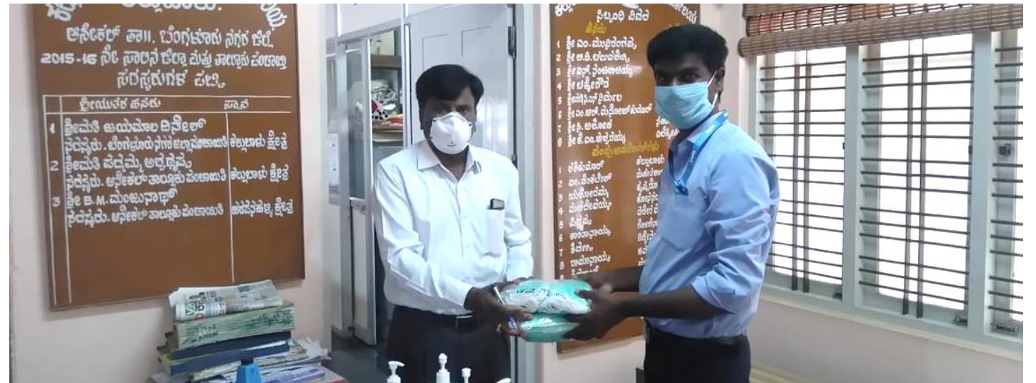
Masks and Sanitizers to Panchayat