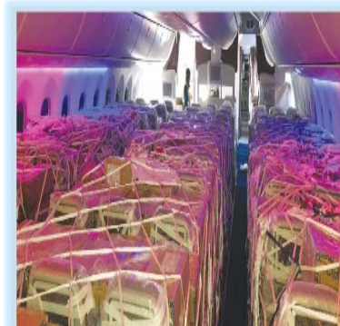
Supply of ARVs despite lockdowns