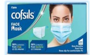
Cofsils Face mask