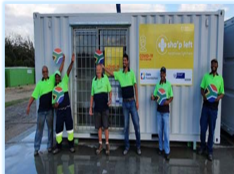
Emergency Healthcare Units for COVID testing